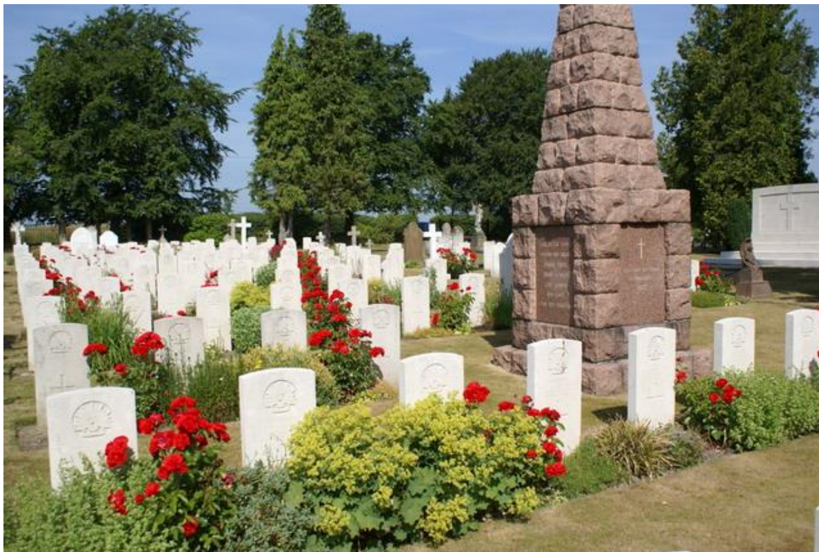
Durrington Cemetery, Wiltshire